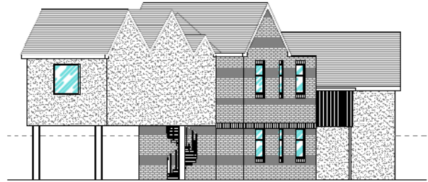
PROPOSED SOUTHWEST SIDE ELEVATION